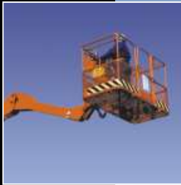
Alcance Extendido Mayor Versatilidad