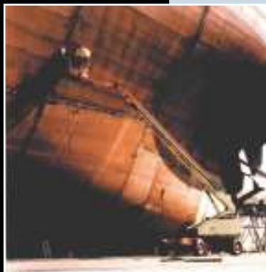
Rendimiento y Confiablez