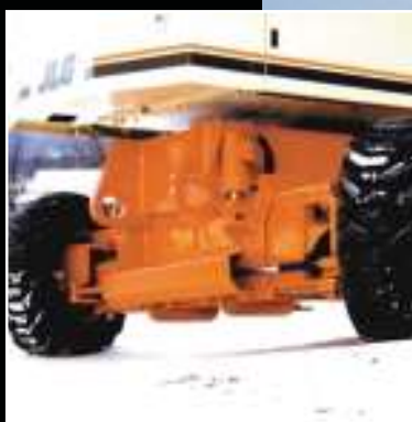
Eje Oscilante para Terreno Irregular